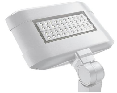
LED Flood Luminaire (Adjustable Arm)