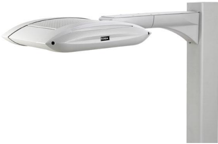
LED Area/Parking Lot Luminaire (Available with Adjustable Arm)