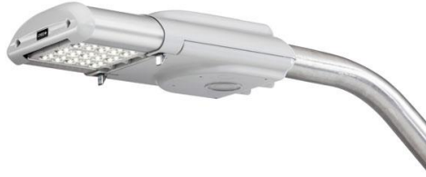
LED Street/Roadway Luminaire (Available with Adjustable Arm)