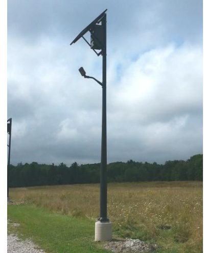
Pole Mounted Street/Area/Flood Lighting- Metal Pole Mounting Options